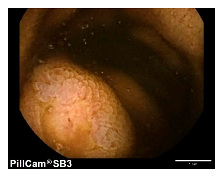
Figure 3. VCE 2023: multiple white submucosal nodules seen in the small intestine.

The patient's 12 year-old daughter, during a routine dental checkup, was found to have a white and painless nodule on the tongue, at high clinical suspicion for a granular cell tumor. She was asymptomatic and denied any symptoms of dysphagia, food impaction or weight loss, her past medical history was unremarkable and her physical and psychological development were within the norm; she regularly attended school.