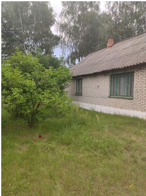
Figure S19. Photos of the experimental plot Babchin (Polesye State Radiation-Ecological Reserve, Gomel Region, Republic of Belarus) GPS coordinates : 51.791470, 30.007070