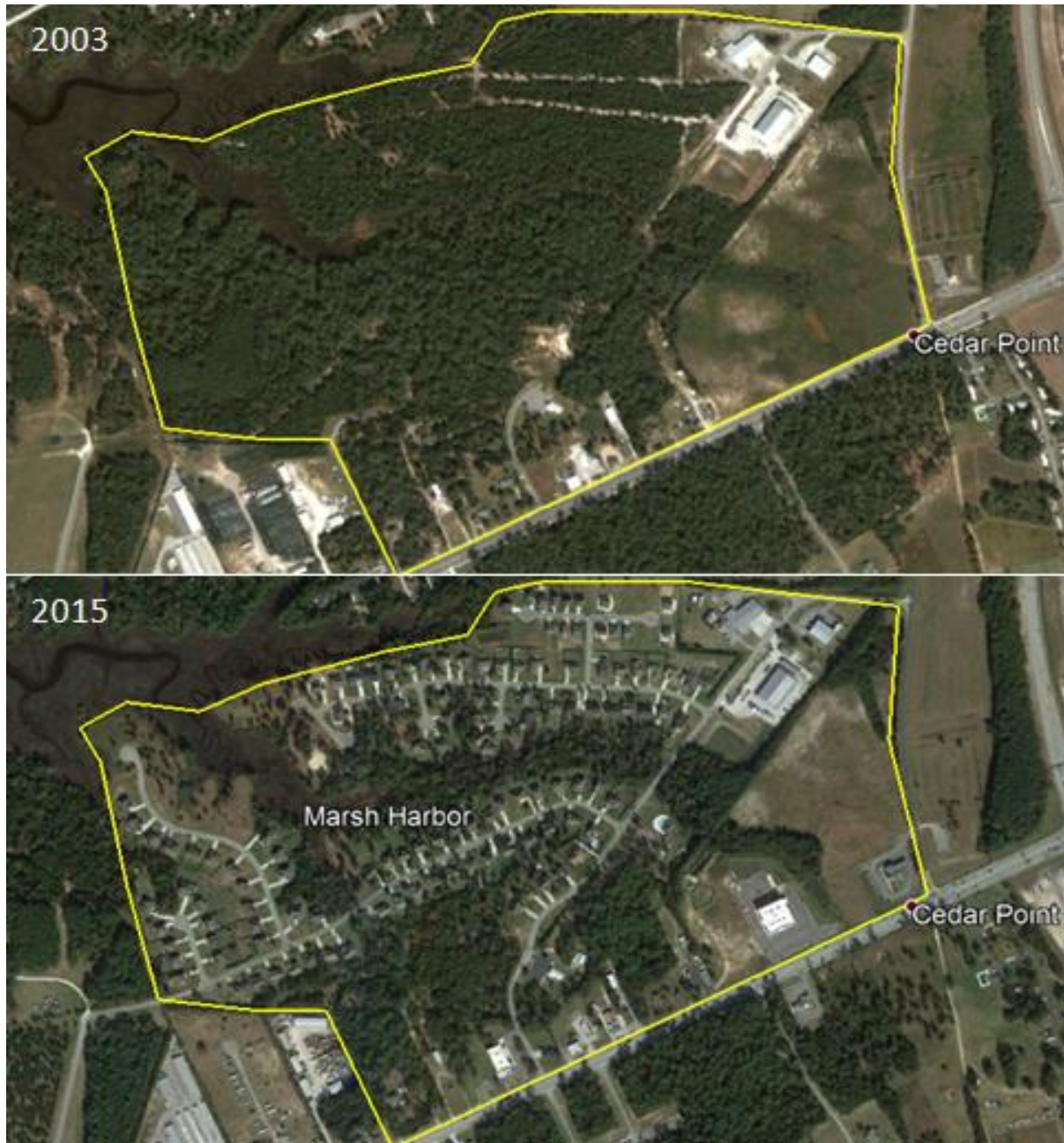
Marsh Harbor community within the Boat House Creek Watershed in 2003 (top) and 2015 (bottom) showing extensive development over the 12 year period.