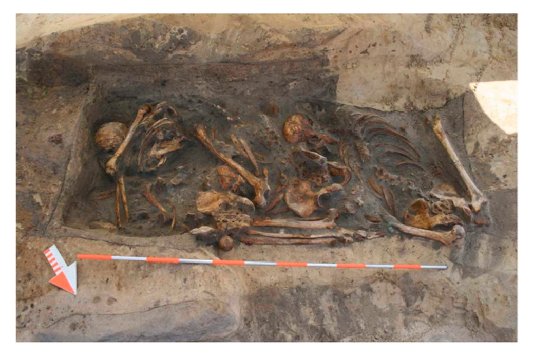
Figure 1. The grave contains the three analysed individuals. Source: Rath et al. (2022). Genetic and isotope analysis of a triple burial from medieval St. Peter's cemetery in Cölln/Berlin.

This study analyses a German cemetery where a necropolis of the ancient medieval city is located. They carried out the study of three individuals who were present in the same grave (Figure 1), with the aim of, on the one hand, checking whether they were related and, on the other hand, knowing the possible biogeographical origin of each of the individuals. The analysis of autosomal markers indicated that the three individuals were not closely related. Concerning lineage markers, mtDNA and Y-chromosome analysis allowed the authors to conclude that two of the three individuals would be local, and one would possibly be from abroad, and these results were also corroborated by isotope analysis. Considering the burial of the individuals (Figure 1), the authors consider that "maybe the men shared a social bond not related to genetically detectable parameters, or perhaps the circumstance of their death (e.g., location or cause) is the only thing that brought these three unfortunate souls together. The archaeologists assume that the men were killed by more than one assailant, as the injuries that can be seen on each of the skeletons were caused by different weapons."