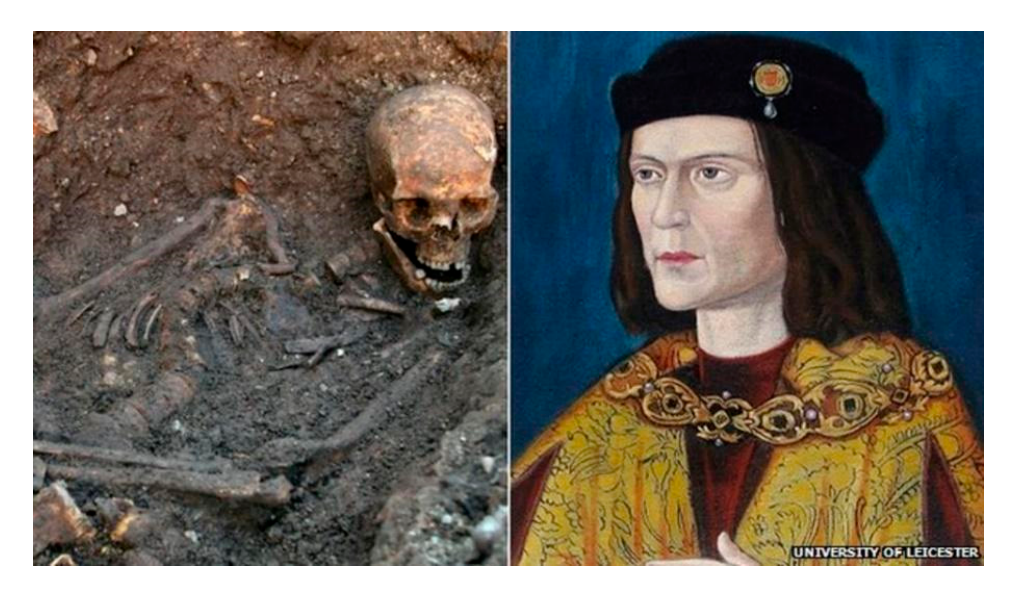
Figure 3. Bone remains were later found associated with the English monarch Richard III, who died in the 16th century and who had been in an unknown location for almost 530 years. On the right, one of the painted representations of the monarch, used as a source of comparison for the genetic analysis of the external phenotype

(e) A Medieval burial in medieval Castilla y León (Segovia, modern Spain).