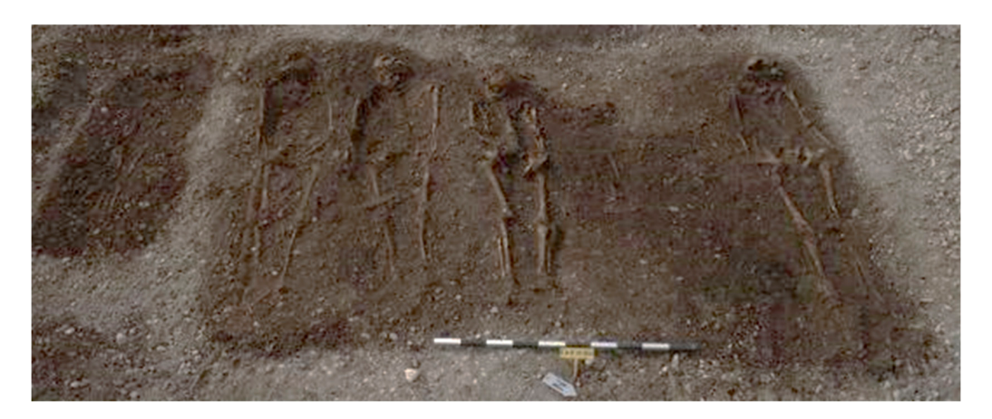
Figure 2. Example of individuals from a quintuple burial.

related to each other, the authors advance a hypothesis linked to a critical stage of medieval Europe, specifically "The Plague", in this case, the Justinian Plague (541–750 A.D). They also reflect on some forms of burial of individuals, namely when individuals are observed "holding hands", which could lead an archaeologist to think that the individuals were related, and the genetic study shows that they are not.