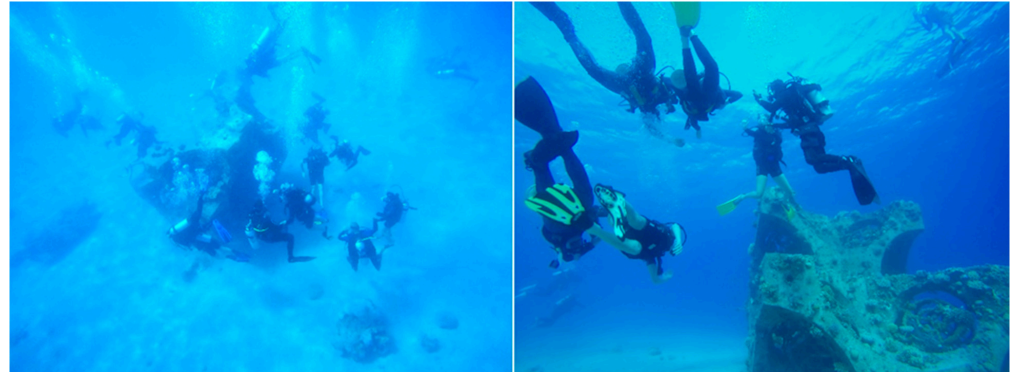
Figure 2. Introductory dives gathered around the 4 \times 4 \times 4 m large artificial reef. Left—8 instructor and guest pairs. on 15 October 2019. Right—4 pairs. on 5 October 2023.

and during the 2023 Sukkot holiday (29 September–6 October 2023), they dropped to ca. 200 introductory dives per day (Figure 2). Indeed, introductory dive guides regarded their job at these times as very demanding, referring to themselves as “tea-bags”.