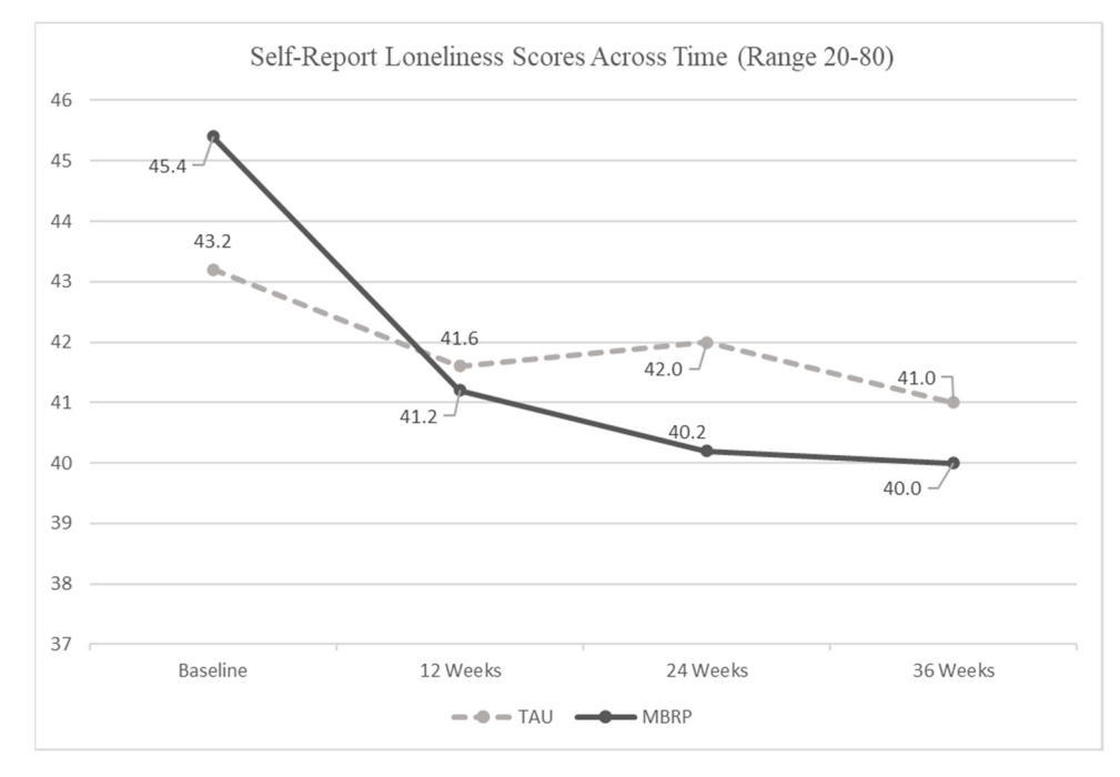
Figure 2. Self-Report Loneliness Scores by Group across the 36 Week Intervention from the Linear Mixed Model.

Nevertheless, given the sharper reductions in reported loneliness scores observed among MBRP/MOUD participants in comparison to the TAU/MOUD participants between the baseline and 12-week data, we investigated the decline in loneliness across time in the MBRP/MOUD group and found significance (F = 13.83, p < 0.001). This exploratory result suggests loneliness decreased in the MBRP/MOUD group more than the TAU/MOUD group from baseline to 12 weeks.