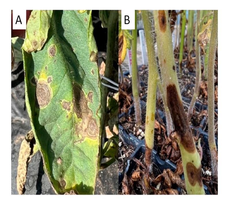
Figure 1. Early blight symptoms shown by infected plants: concentric ring symptoms are seen on leaves on the left side ( A ), whereas stem girdling and spots on the right side ( B ) are caused by Alternaria linariae infection.

of an infection. The lesions typically have a yellow halo around them. Dark, concentric rings with a "bullseye" look can be visible within these lesions. The leaf blight phase typically starts on the lower, older leaves and works up the plant. Similar signs on the stem and fruits can also be visible as the disease progresses. On stems, symptoms include collar rot, stem cankers, and sunken, elliptical-shaped brown lesions with a light center and concentric rings (Figure 1). Alternaria linariae has a broad host range, although it is reported most frequently on tomatoes and potatoes. Other members of the solanaceous crop family, such as eggplant, sweet pepper, and solanaceous weeds (such as black nightshade— olanum pytcanthum ) are also infected by this pathogen [11,14].