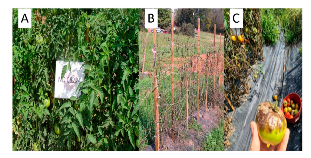
Figure 2. Late blight symptoms on leaf, stem, and fruits. Symptoms progress rapidly and can cover the whole plant within seven to ten days, showing a brown discoloration of infected tomatoes over the entire plant. The picture on the right is a resistant hybrid released as 'Mountain Rouge' ( A ), whereas the center and right are susceptible genotypes showing symptoms on the whole plant ( B ) and the fruits ( C ).

Tomatoes affected by late blight disease exhibit small, water-soaked brownish lesions along the margin of the leaves, which may have chlorotic borders (Figure 2). These lesions rapidly expand, causing necrosis in entire leaves. Under high humid conditions, the pathogen produces sporangiophores and sporangia on the surface of the infected tissue. This results in the whitish color of sporulation on the lower surface of infected leaves, characteristic of the disease. The leaf lesions coalesce and cause the foliage to appear blighted as the disease progresses quickly. While the disease primarily causes foliar blight, it can also result in black discoloration in the stem and shoulders of ripe fruits in a later stage. Infected fruits show shallow, brown, or purple lesion-like discoloration on their surface [15,21,22].