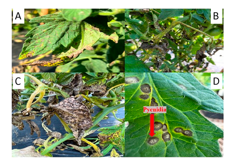
Figure 3. Symptoms on leaf and stem caused by Septoria leaf spot in tomato. Symptoms on the leaf and stem ( A–C ). Black color pycnidia formed on spots developed by Septoria on leaves ( D ).

in the northeastern USA and Canada [26]. Only one haplotype of this fungus has been reported [27]. The fungus reproduces through conidia formed in pycnidia discharged in the rain or spray irrigation and spread through water droplets. The disease has been reported in every tomato-growing region. It occurs worldwide and is worse in damp, humid climates. All aerial sections of the plant can be infected by this pathogen, with rare incidences on fruits [28]. Although this fungus can affect tomatoes at any growth stage, symptoms typically appear on the older, lower leaves and stems when the first sign of fruit set starts under field conditions. Typical symptoms include small, round, or oval water-soaked spots on the undersurface of lower leaves that gradually turn dark in color and develop to become necrotic lesions with a tan or light grey center (Figure 3). In addition to leaves symptoms may appear on petioles, stems, and the calyx [29]. Necrotic patches on older leaves could have a chlorotic ring, a yellow halo surrounding them. Numerous circular spots can be seen on infected leaves. The old spots enlarge and frequently merge, giving a blighted appearance. Spotted leaves eventually turn yellow and die too quickly, causing early defoliation. Defoliation typically starts with the oldest leaves and can quickly move up the plant toward new growth [28].