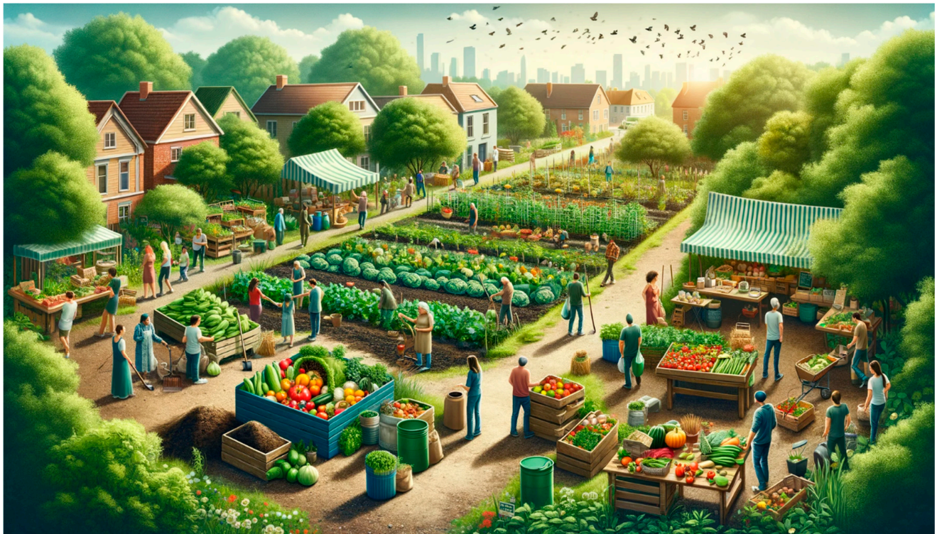
Figure 2. A multifaceted approach to sustainable agriculture, encompassing environmental, economic, and social dimensions. Illustrated is a vibrant community garden, a bustling marketplace, and an efficient composting area. The garden symbolizes environmental sustainability through organic farming and biodiversity conservation. The marketplace represents economic sustainability, showcasing the direct sale of locally grown produce, thereby supporting the local economy and reducing food miles. The composting area highlights waste reduction and nutrient recycling, which are essential for sustainable resource management. Additionally, this setup fosters social sustainability by enhancing community engagement, providing employment opportunities, and improving the overall quality of life for residents. (Note: the image was created with ChatGPT with a specific user-defined prompt to represent the author’s perspective).