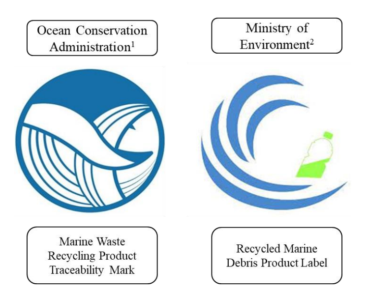
Figure 1. Taiwan's certification labels for products made from materials recycled from marine debris.

recyclers, suppliers of materials, manufacturers, and financial investors. However, as noted previously, the cost of materials recycled from marine debris is high. It is therefore important to enhance the market penetration of recycled marine debris products, despite the high cost, such that the supply chain will survive and even thrive. To this end, Taiwan has created two certification labels for recycled marine debris products (as seen in Figure 1) as an attempt to facilitate consumers' awareness of such products and to further enhance their intention to buy them. One is the 'Marine Waste Recycling Product Traceability Mark' [37]. The other is the 'Recycled Marine Debris Product Label' [38].