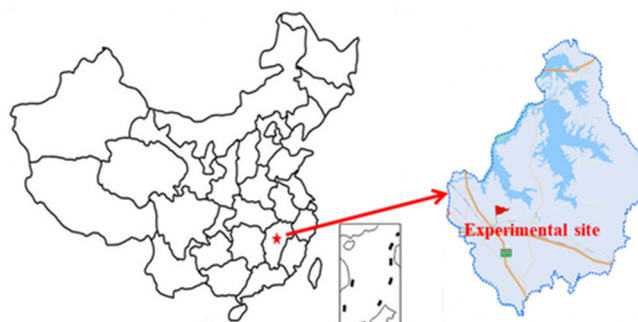
Figure 1. Location of the experimental site.

crops in the region, Jiangxi province being one of the main red soil areas of China. Data in this manuscript were collected from October 2019 to September 2020.