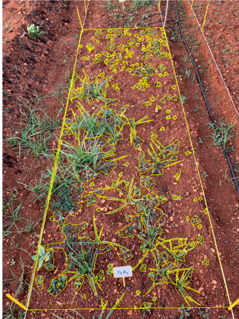
Figure S1. Image of a plot processed with Digimizer to measure the weed coverage.