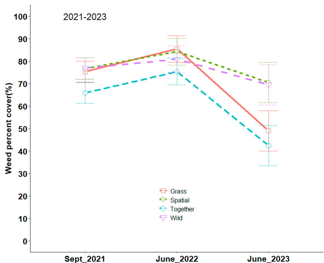
Figure 3. Mean weed cover among the four planting treatments of NWSG and WF components. Means are plotted \pm 1 SE.

Weeds dominated plots especially in 2021 and 2022 where ground cover ranged between 65 and 80% (Figure 3). Weed cover did not differ among treatments in 2021 ( F_{3,9} = 1.22 , p = 0.3590 ) or 2022 ( F_{3,9} = 0.57 , p = 0.6488 ). However, weed cover was marginally lower in treatments where NWSGs and WFs were sown together in 2023 ( F_{3,9} = 3.78 , p = 0.0527 ).