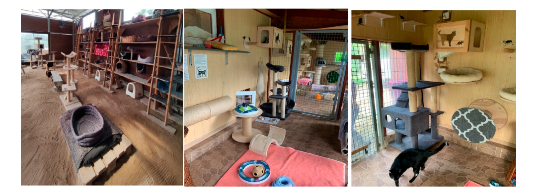
Figure 2. Examples of hiding places, beds, and scratching posts.

Hair was collected only from cats socialized with humans, showing no fear or aggression towards humans. Until biochemical analyses, the material was stored in string bags in a dry place at room temperature, adequately described. More cats used the resources than participated in the research.