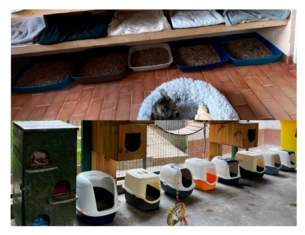
Figure 3. Examples of litter boxes.

tubes. Next, this supernatant was evaporated to dryness under an air-stream suction hood at 37 °C. Dry residue was then dissolved into 1 mL of phosphate-buffered saline (PBS) 0.05 M, pH 7.5. Samples were vortexed for one minute, followed by another 30 s until they were well mixed. The cortisol concentrations in the samples were determined with the DRG Salivary Cortisol HS ELISA assay. The procedures followed the manufacturer's instructions. Cortisol concentrations were expressed in ng/mg.