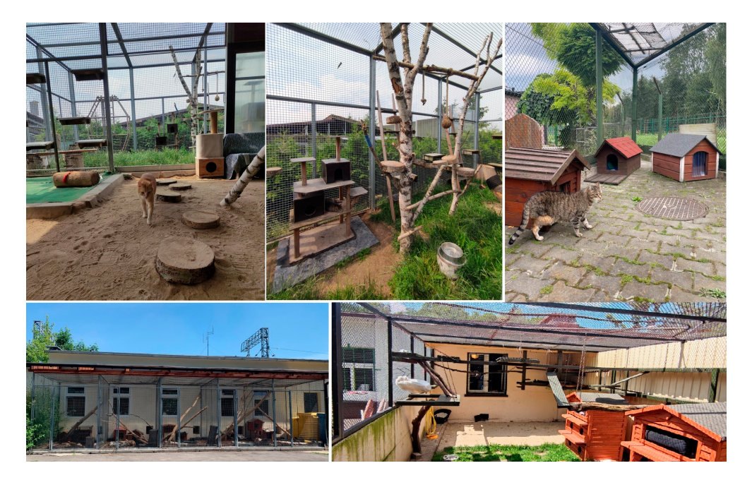
Figure 1. Examples of outdoor aviaries available for cats.

lower the cortisol concentration may be. Kirchbaum called this the washout effect [18]. In cats, this may be related to the frequency of self-grooming [19]. We took 1 cm to determine cortisol in the last month and the highest cortisol concentration section. Since it is assumed that hair grows an average of 1 cm per month [20,21], each cat stayed in the shelter for at least one month and a maximum of two months before collecting biological material. This applies to both the first and second parts of the research. In the first stage, we collected hair from cats that had been living in a standard environment for at least one month. After adding environmental enrichments, we waited at least one month before collecting hair a second time. The cats in the second stage of the research were not the same as those in the first stage, so we didn't use the "shave-reshave" method [22,23].