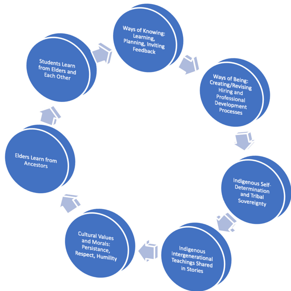
Figure 2. A Yakama Indigenous storytelling model.