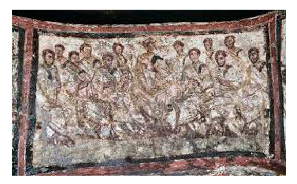
Figure 1. Christ with his disciples, fresco Catacomb via Anapo, Rome.

This portrait of Jesus was evident in the arts from the second half of the third century, where Christ, following the model of the ancient philosophers, was revealed as having authority (Testini 1963). Among the frescoes in the anonymous catacomb in via Anapo, along via Salaria in Rome, Christ, dressed in the clothes of a philosopher, is depicted seated and making the gesture of speaking while surrounded by the twelve apostles (Figure 1). Additionally, in the catacomb of Saint Domitilla, Christ is depicted surrounded by his apostles (Figure 2). Such representations emphasize his role as a master.