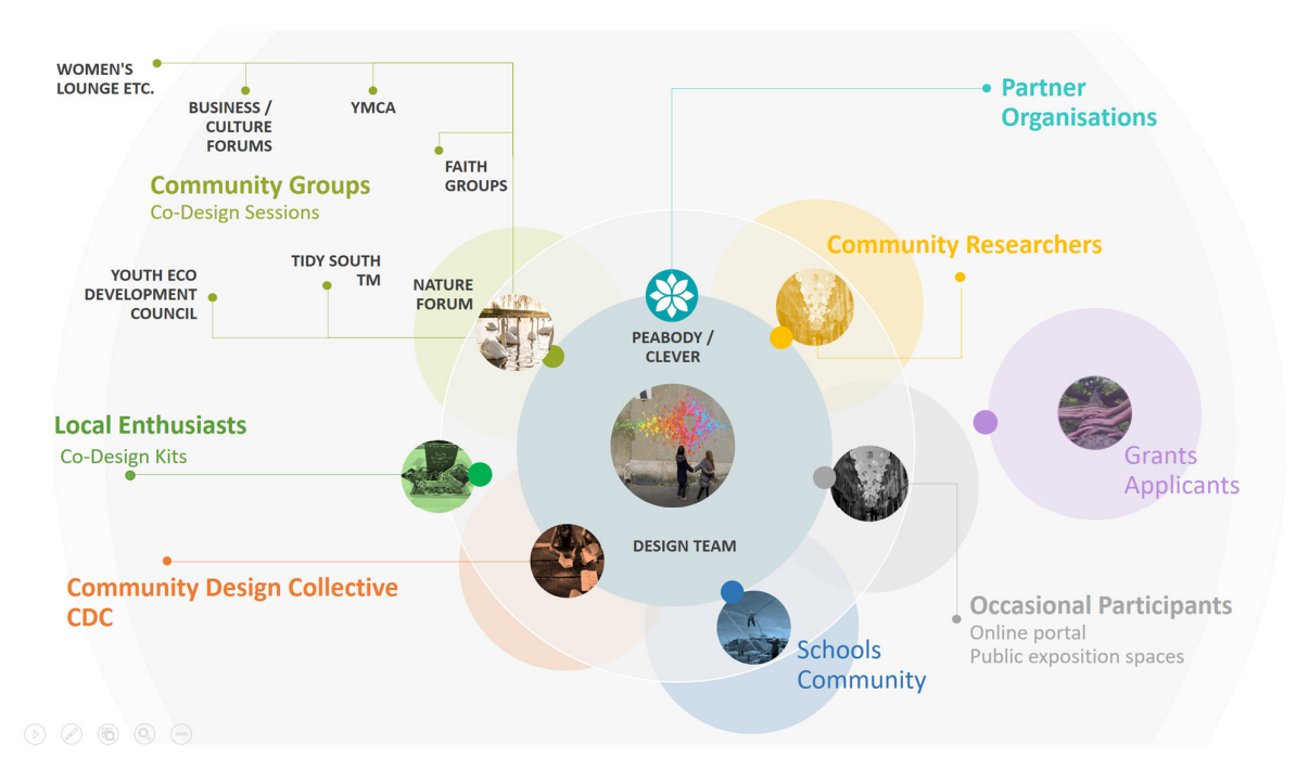
Figure 2. Components of the Urban Innovation Partnership (UIP) in London.

Responding to the distinct context of Thamesmead, London has developed an integrated UIP with thematic focused CALs, in a multi-stakeholder arrangement that allowed for different channels of contribution to decision making (which can be seen in Figure 2).