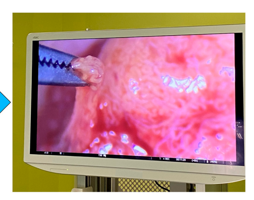
Microscopic Dissection of Testicular Parenchyma to Identify Enlarged Seminiferous Tubules

Figure 3. Surgical procedure of mTESE highlighting dilated tubuli.