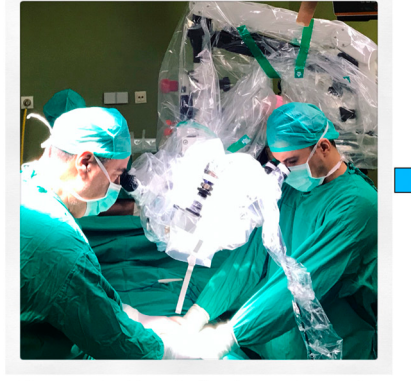
Microsurgical Testicular Sperm Extraction (mTESE)

To better illustrate the intricacies of the mTESE procedure, the following Figure 3 provides a detailed view of the surgical process, emphasizing the identification of dilated tubuli, which are often targeted during the extraction.