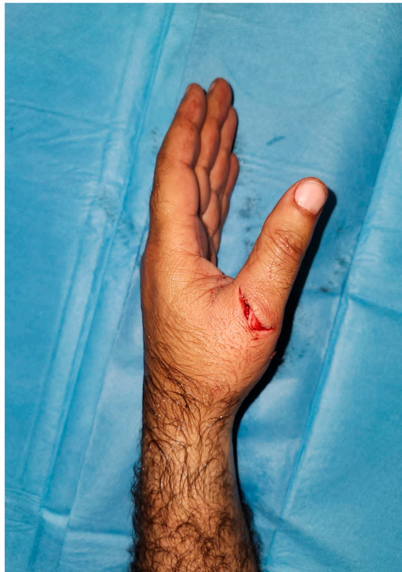
Figure 2. A 35-year-old male who suffered from a knife injury to his extensor pollicis longus tendon. This case belonged to the most common patient and injury type.

a left-hand injury with a knife was the most common anatomical location and mechanism (Figure 2). Fortunately, meat mincer injuries, which cause more serious trauma such as amputations, were rarer than knife injuries. However, injury with a sharp instrument such as a knife causes exposure to injuries below skin level. The process of slaughtering the animal and then slicing the meat explains the high incidence of knife injuries. Since this process will continue throughout the four days of the festival, the incidence of knife injuries is high for each day. It is also believed that the nondominant hand sustains more cuts from knives [13].