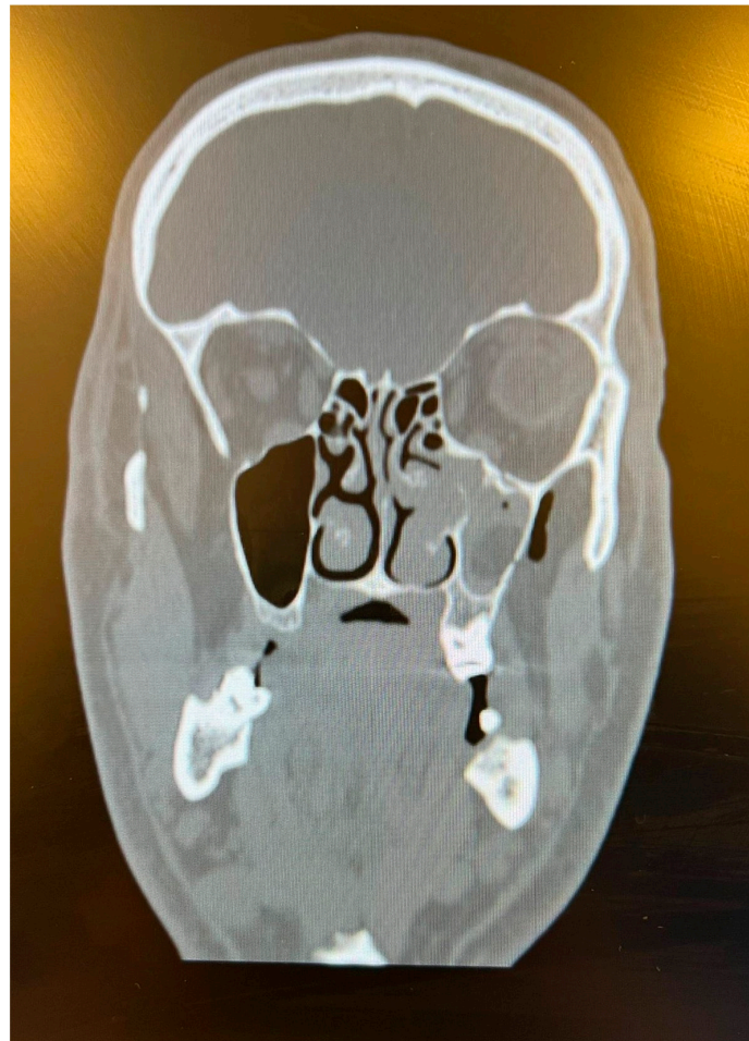
Figure 3. A 38-year-old male who suffered an animal kick to his face. The CT scan shows a left-sided orbital floor fracture.

As plastic surgeons, we observed that there were not only hand injuries but also maxillofacial traumas. During the Eid al-Adha period, the number of people traveling between cities increases, which leads to an increase in traffic accidents. In the literature, it was previously reported that being on vacation plays a role in crash severity [14]. A total of 25 patients with maxillofacial trauma were enrolled in our study. Notably, 40% of the patients had orbital floor fractures, which represent the most common injury type (Figure 3). This fracture was caused by the impact of an injuring agent incapable of transitory deformation, such as traffic accidents, or the body part of an animal, which we encountered in two patients. Two out of thirty-six cases of animal kicks resulted in orbital fractures, which is a significant number and something that emergency services should take into consideration during this festival.