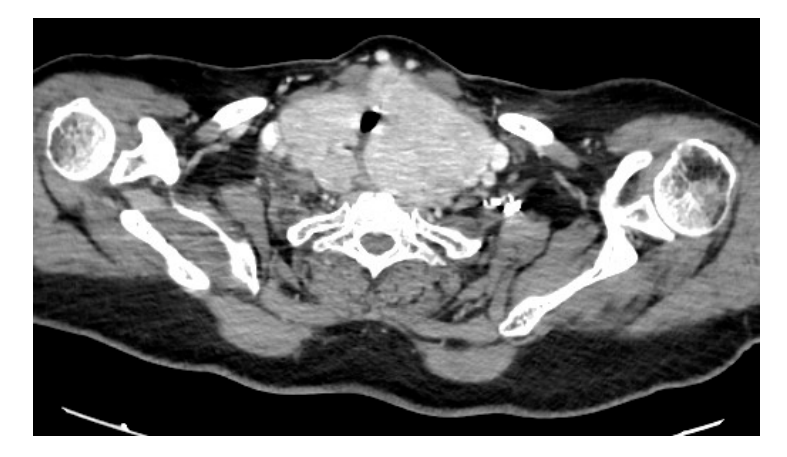
Figure 2. Computed tomography (CT) scan at the level of the thoracic inlet showing enlargement of the thyroid gland with locoregional extension and signs of compression.

Figure 1. Computed tomography (CT) scan of the neck and thoracic inlet (sagittal view) showing enlargement of the thyroid gland with retro-laryngopharyngeal and retrosternal extensions.