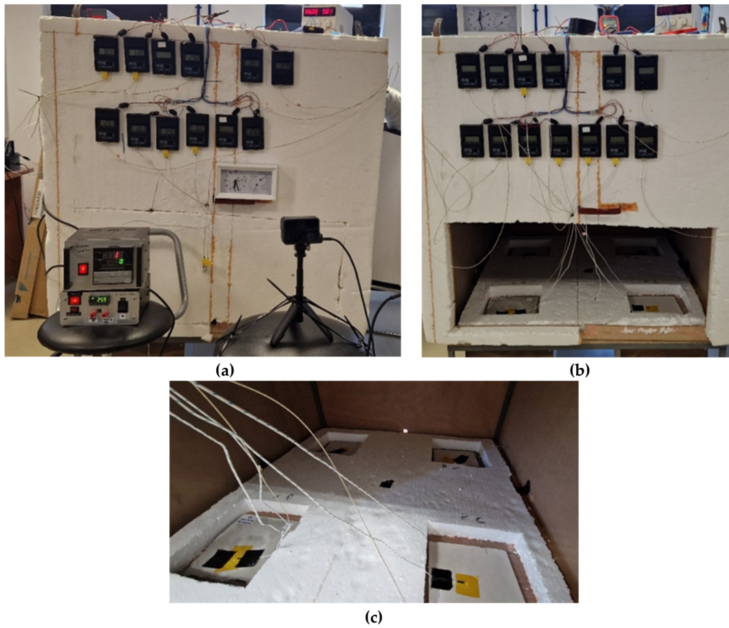
Figure S1. Pictures from the custom made environmental chamber. a) The chamber during the measurements, b) and c) the internal area of the chamber.