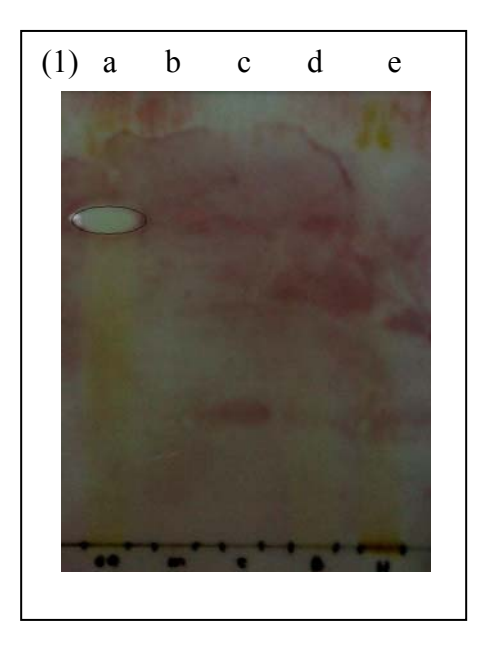
Figure 1. Bioautogram of fractions and antibiotics sprayed with actively growing methicillin resistant Staphylococcus aureus (MRSA). White areas indicate zones of growth inhibition. a : ethyl acetate fraction. b : methicillin. c : vancomycin. d : butanol fraction. e : hexane fraction.

The microbial strains for bioautography were selected based on their sensitivity to CSLE and fractions. The CSLE and ethyl acetate fractions demonstrated the lowest MIC against MRSA, whereas the CSLE and butanol fractions exhibited promising MIC towards E. coli . Hence, both of these bacteria (MRSA and E. coli ) were selected for the bioautography assay. The bioautography assay exhibited inhibition zones (Rf value = 0.77) for ethyl acetate fraction against MRSA (Figure 1).