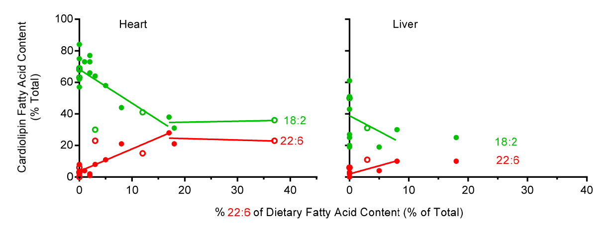
Analysis of 22:6 levels in heart CL (Figure 2) shows that when 22:6 is absent in the diet a small amount of 22:6 (2%–8%) is still present in CL, demonstrating conversion such as that of 18:3 by the liver (the primary 22:6 synthesizing organ in mammals [53]) and its incorporation into heart CL. When