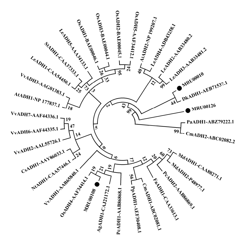
Figure 4. Alignment of alcohol dehydrogenase (ADH) gene family members of Chinese bayberry with other plant ADHs based on amino acid sequences.