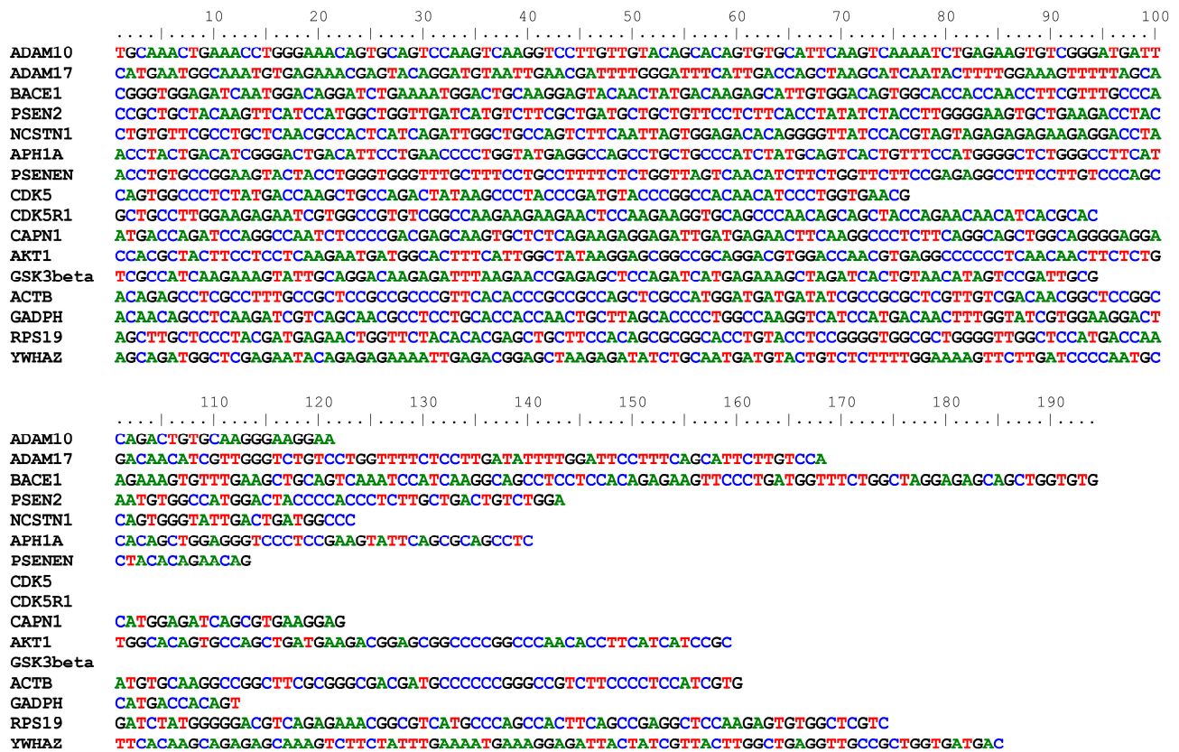
Figure S2. Nucleotide sequences of APP pathway-related genes, tau phosphorylation-related genes and reference genes from the cynomolgus monkey.