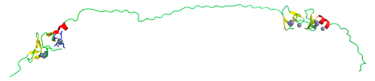
Figure 2. IntFOLD server model of Cardiac MLP. The central and terminal regions are both thought to contain disorder, as found within the other members of the CRP family. The ordered domains are predicted to contain zinc binding sites; likely locations of zinc atoms are indicated by grey spheres. The image is rendered using PyMOL [56].

Similar server comparisons were carried out by Ferron and colleagues in 2006 [55]. Although disorder predictors have since been improved, this older study also highlighted how variable predictions can be. For example, Heat-Shock Factor binding Protein 1 was known to contain disorder at residues 1–8 and 58–76. RONN and IUPRED were found to predict borderline disorder for the whole protein which is known to be incorrect. As with MLP, the different predictors show varying levels of disorder, for example PreLink predicts 66–76 residues disordered, whereas DISOPRED 2 predicts 1–6, 61–76 and Disembl predicts residues 1–9,62–76 [55]. Based upon this example, DISOPRED2 and Disembl appear to be most reliable methods, with predictions closest to the known disordered regions. These predictors are therefore more accurate for the short regions of disorder than the others of which were tested.