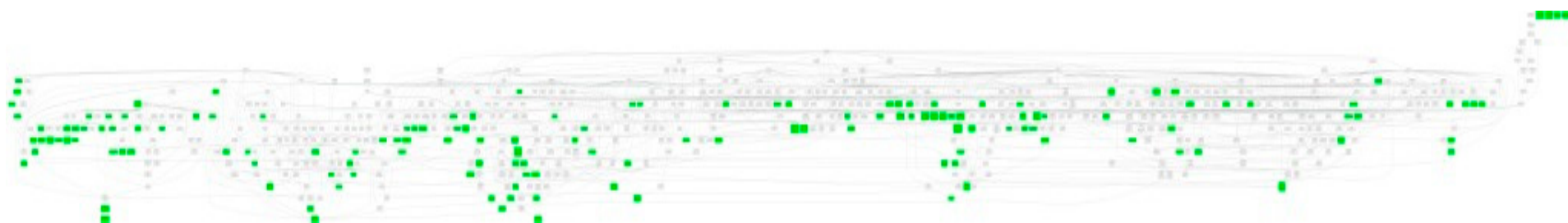
Figure S1. Tree of deregulated GO terms for clear cell carcinoma.