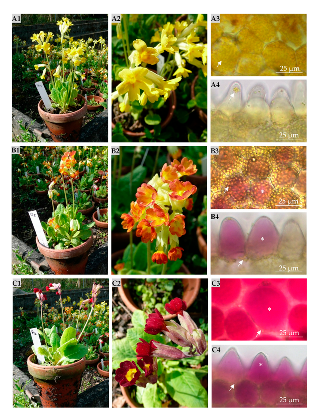
Figure 1. Primula veris L. with different petal colors from the botanical garden of Hohenheim University, May 2015. Overview of P. veris with yellow petals ( A1 ), orange petals ( B1 ) and red petals ( C1 ). Close-up view of the yellow petals ( A2 ), orange petals ( B2 ) and red petals ( C2 ). Light microscopic images of the differently colored petals in supervision ( A3,B3,C3 ) and in cross-section ( A4,B4,C4 ). Yellow chromoplasts (arrows) are shown in the papilliform epidermis cells of the yellow petals. The vacuoles of the cells are colorless ( A3,A4 ). The orange colored petals also have yellow chromoplasts. Papillate epidermal cells are characterized by the occurrence of anthocyanins in vacuoles ( B3,B4 ). Some epidermis cells of the red-colored petals have anthocyanin-containing vacuoles. Yellow chromoplasts ( arrows ) exist, but are masked by the content of the vacuoles ( C3,C4 ).