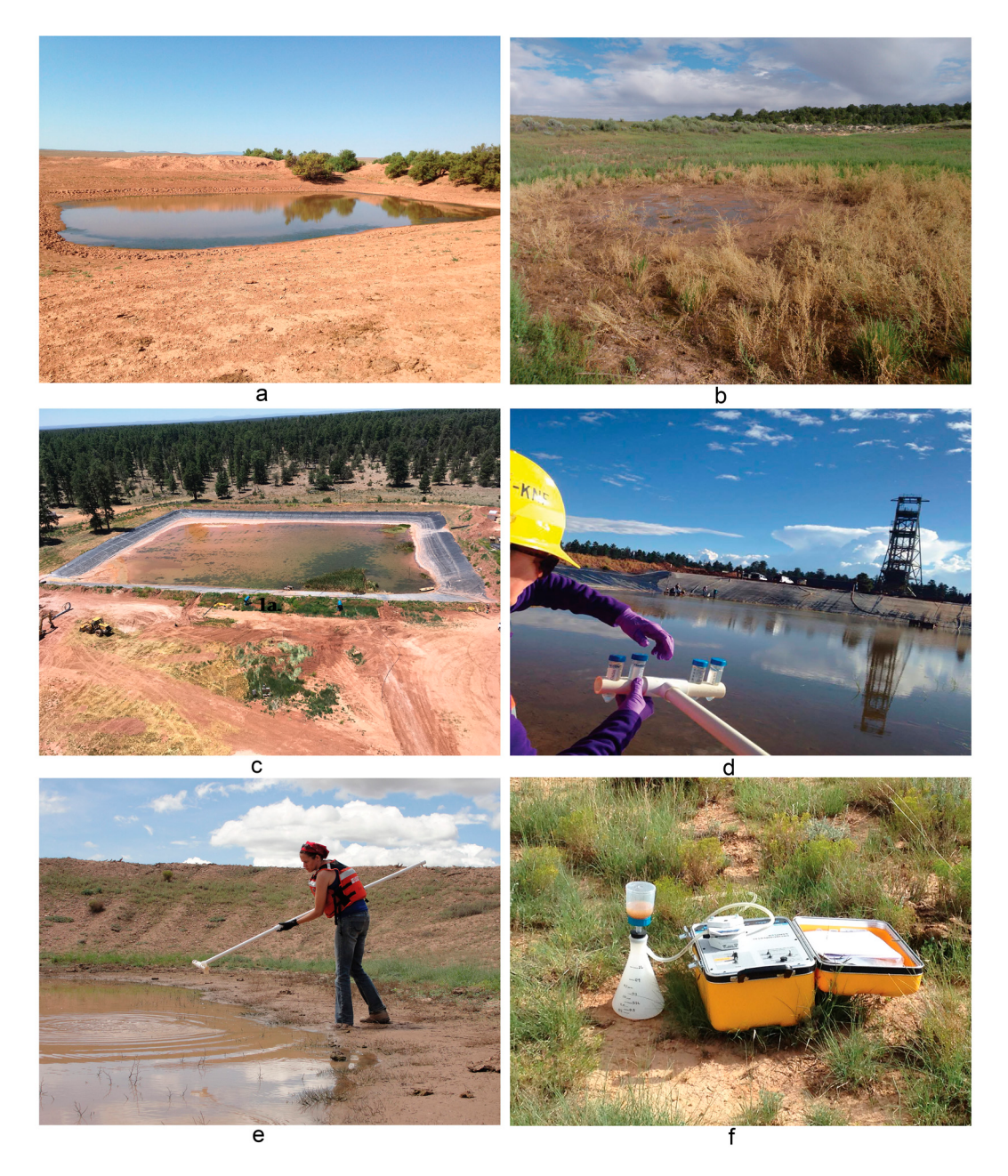
Figure 1. (a) Wild Band tank site during the August 2016 sampling; (b) Pine Nut tank site during the August 2016 sampling; (c) View of the Canyon Mine containment pond; (d) Sampling for eDNA from the Canyon Mine containment pond, using the constructed water sampler; (e) Sampling of Little Robinson tank site using the water sampler; (f) Filtration of a Pine Nut tank sample from August 2016, note the turbidity.

for future use. The halves removed for extraction were allowed to dry and digested overnight with proteinase K. DNA extraction of the filter samples was done using the Qiashredder kit (Qiagen, Hilden, Germany) for cell and tissue lysate homogenization to remove the DNA from the filters, and the DNEasy Blood and Tissue kit for DNA extraction (Qiagen). Purified DNA from each filter sample was re-suspended in 100 \mu L of 10 mM Tris-HCL. Because the filters were cut in half for extraction, the total volume sampled from each filter was divided in half to represent the total volume of water processed for that filter (Tables 1 and 2).