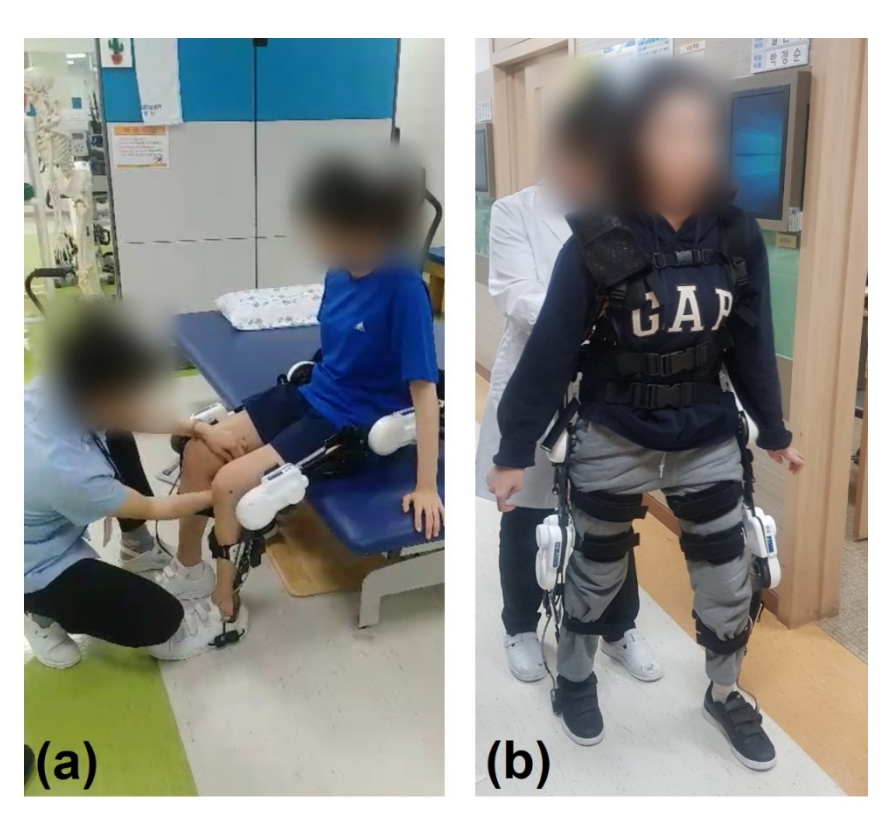
Figure 1. Robotic exoskeleton-assisted overground gait training. ( a ) Standing training wearing ANGELLEGS; ( b ) gait training wearing ANGELLEGS.