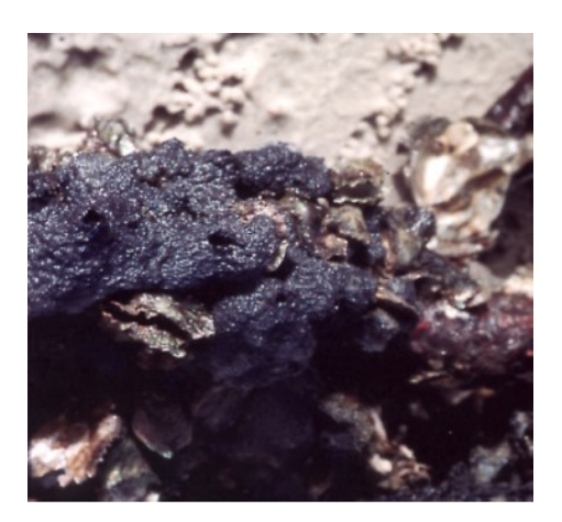
Figure 2. The sponge Axinyssa djiferi.

Axinyssa djiferi (Figure 2) [25,26] is found along the Senegalese coasts about 150 km south of Dakar, near the village of Djifer, on mangrove tree roots, near the surface at low tide and was collected by hand during an expedition organized by Oceanium of Dakar, on the site named Keur Bamboung (Sine-Saloum). The sponge specimens were frozen shortly after collection and then freeze-dried. A voucher specimen was deposited in the Museum National d'Histoire Naturelle MNHN, Paris, France.