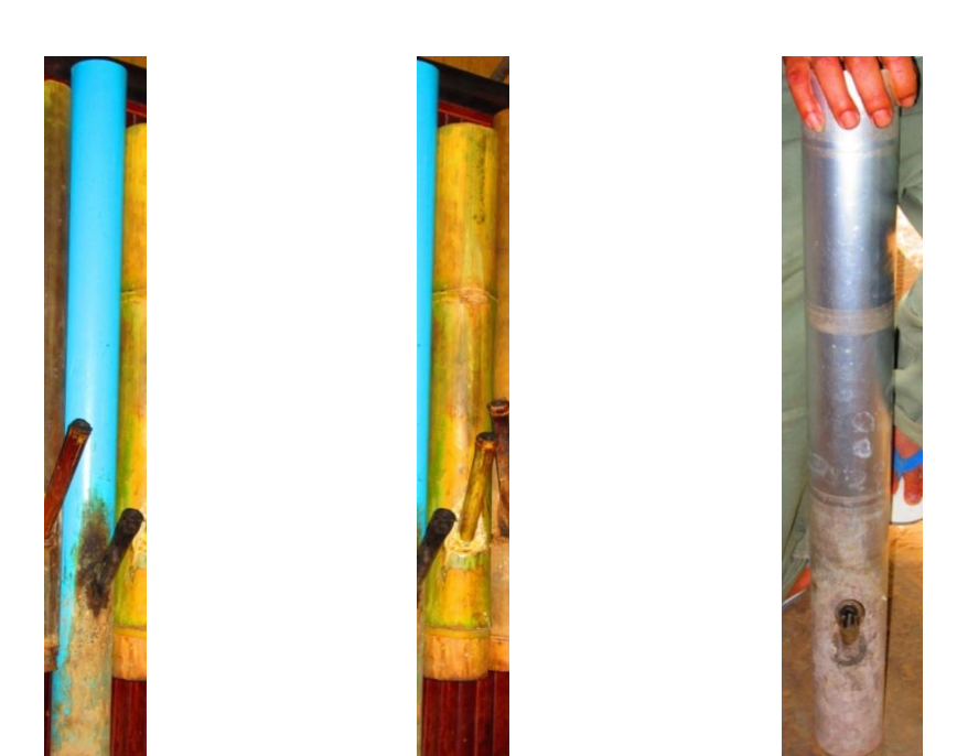
Figure 1. Homemade waterpipes used by study subjects.