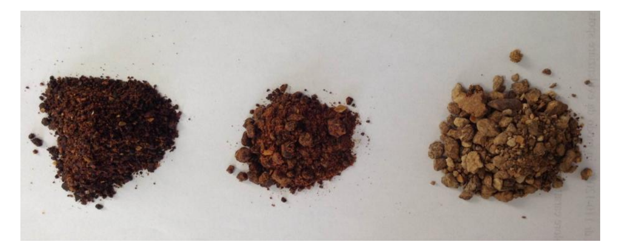
Figure 1. Samples of commercial neem cakes. NCE was obtained from the product in the middle.

extraction of the dried neem cake with ethyl acetate (1:10 wt/v) at room temperature for 24 h [17]. Thereafter the resulted NCE was dried and kept at -4 °C until further uses.