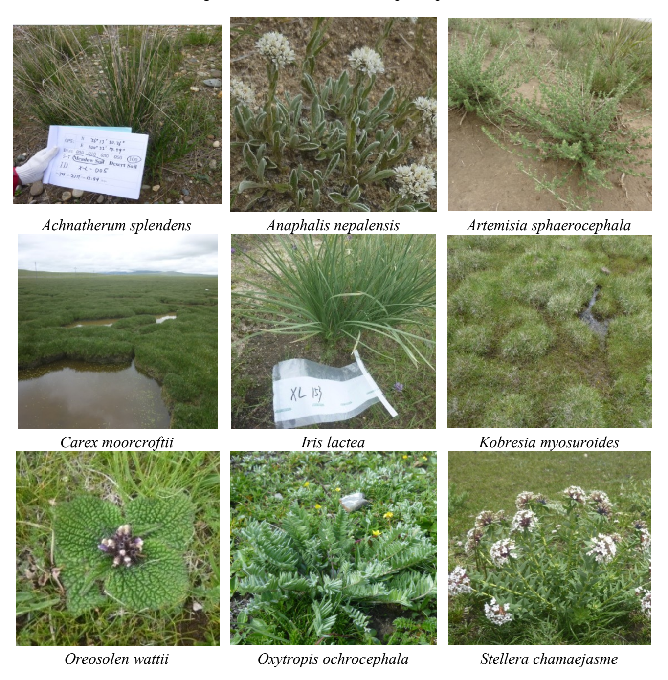
Figure 2. Photos of the selected grass species.

As shown in Figure 2, nine species of grasses ( Achnatherum splendens , Anaphalis nepalensis , Artemisia sphaerocephala , Carex moorcroftii , Iris lacteal , Kobresia myosu roides, Oreosolen wattii , Oxytropis ochrocephala and Stellera chamaejasme ) were selected in this study, with consideration of the following two primary factors: (1) most of these grasses are endemic plants in the Qinghai-Tibet Plateau; (2) the grasses are abundant at the sampling site. A total of 100 grass samples were collected using a wood scissor from the same sites where the soil samples were collected. The sample size and description of variables related to each grass sample are shown in Table 3.