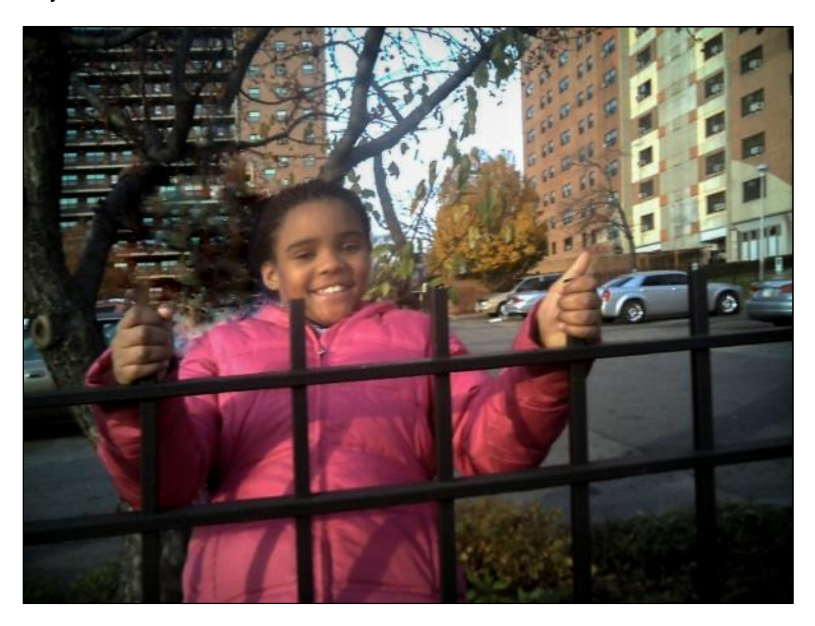
Figure 3. Photo caption: the real world; Health topic: heart; "My photo is of my friend. She is a real person. She doesn't wear makeup. She is true to herself. She is creative and helps me when I am in trouble and helps me do my chores. This photo shows how she is enjoying herself with me and our friends. We were having fun. Friends are important because they help me and don't say no...they really care for me. We can share secrets and trust each other. You can rely on a friend. I do not even have to pinkie promise with my friend. She is so strong. Lying to a friend shows they are not your true friend. Other people in my class lie and steel from me. Like my friend, I trust my mom too, but I haven't seen my dad since I was 3 years old so I do not know if I can trust him".

life. Support of family and friends in fact was what most of the children felt helped them to continue to hope for a better future in "hard times".