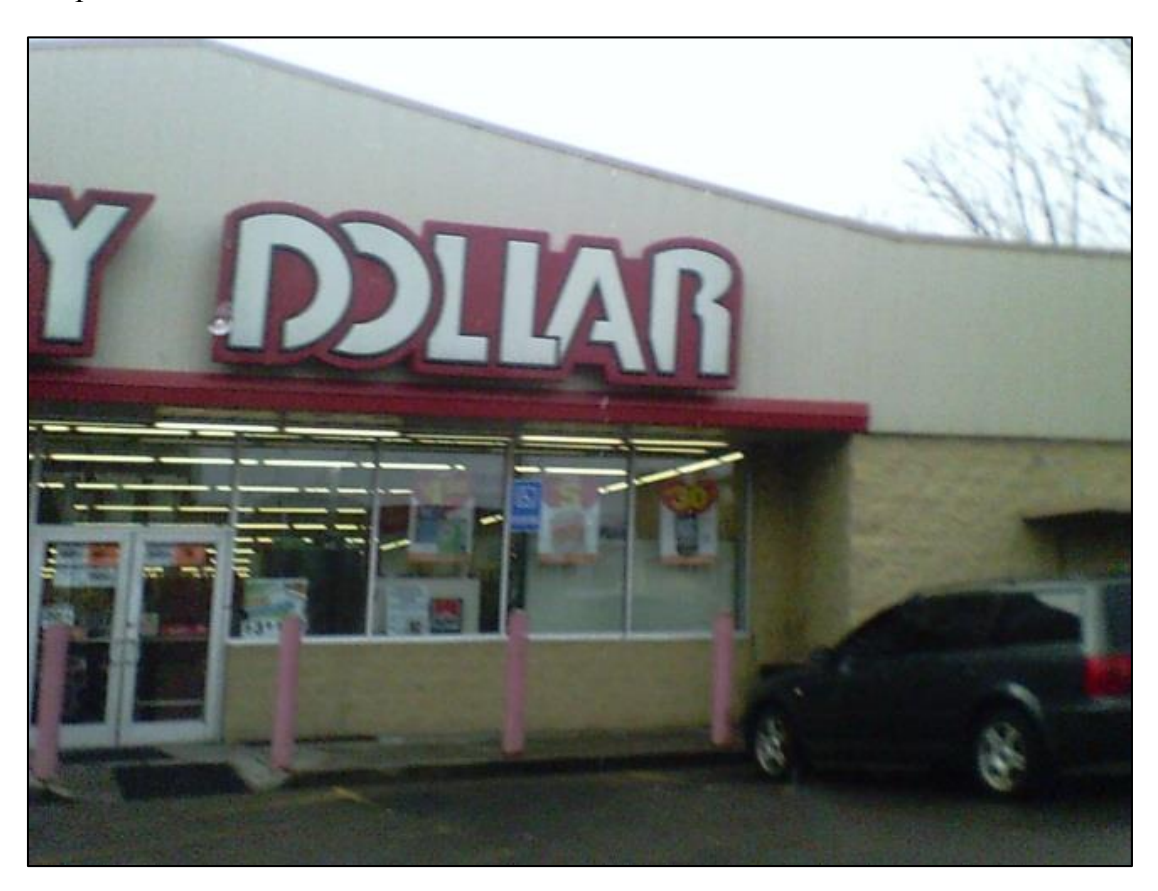
Figure 1. Photo caption: foods all about it; Health topic: body; "I go to Family Dollar when my momma feels like it. It sometimes is cheaper than Kroger, sometimes not. We get milk, cereal, juice, popcorn, and candy. We take the bus to the store so my momma doesn't waste her gas. We sometimes go twice in a day since we can't carry that much. I see a lot of people I know there. People can't buy healthy food there. They want snacks. They are delicious. You don't want people to think you don't have candy every day. Everybody has candy after school, at school and at home. I eat a lot of candy. My family eats healthy sometimes but I am my own person. I tell them "don't push my buttons and I won't push yours". All 4 of the kids in my family eat bad food and candy. We all talk back to our parents too".