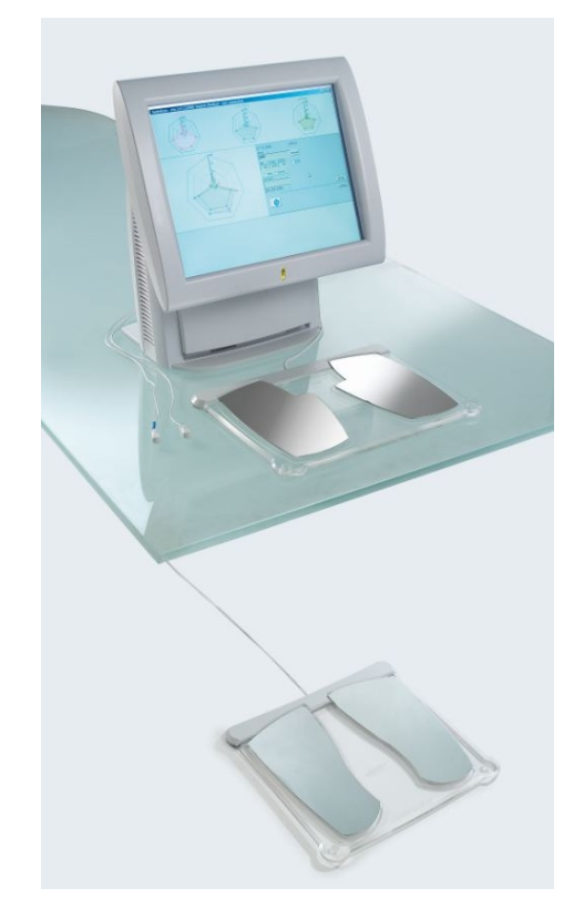
Figure 1. General Presentation of the SUDOSCAN Device with Hand and Foot Electrodes.

Sudomotor function assessment: SUDOSCAN (Impeto Medical, Paris, France) is a new patented device designed to perform a precise evaluation of sweat gland function based on an electrochemical reaction between sweat chlorides and electrodes in contact with hands and feet using reverse iontophoresis and chronoamperometry [10,11]. The apparatus consists of two sets of stainless-steel electrodes in contact with the palms of the hands and soles of the feet where sweat gland density is the most important and connected to a computer for recording and data management purposes (Figure 1).