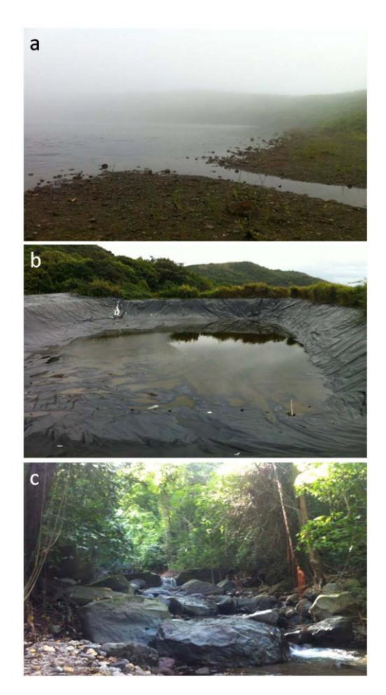
Figure 2. Sample collections sites: (a) a pond; (b) a water dam; and (c) a stream.

Mountain springs are sources of drinking water on the island. Water dams are 110 feet long, 100 feet wide and 12 feet deep reservoirs located in the mountains to collect rainwater that is used by farmers for irrigation (Figure 2). For qPCR, 300 mL water was collected from each site. Each sample received a unique number and was stored at -20 °C, not more than 48 h, until processed. Additional 300 mL water samples were collected from eight water dams and five mountain springs for culturing of leptospires. Culturing from other samples was not attempted.