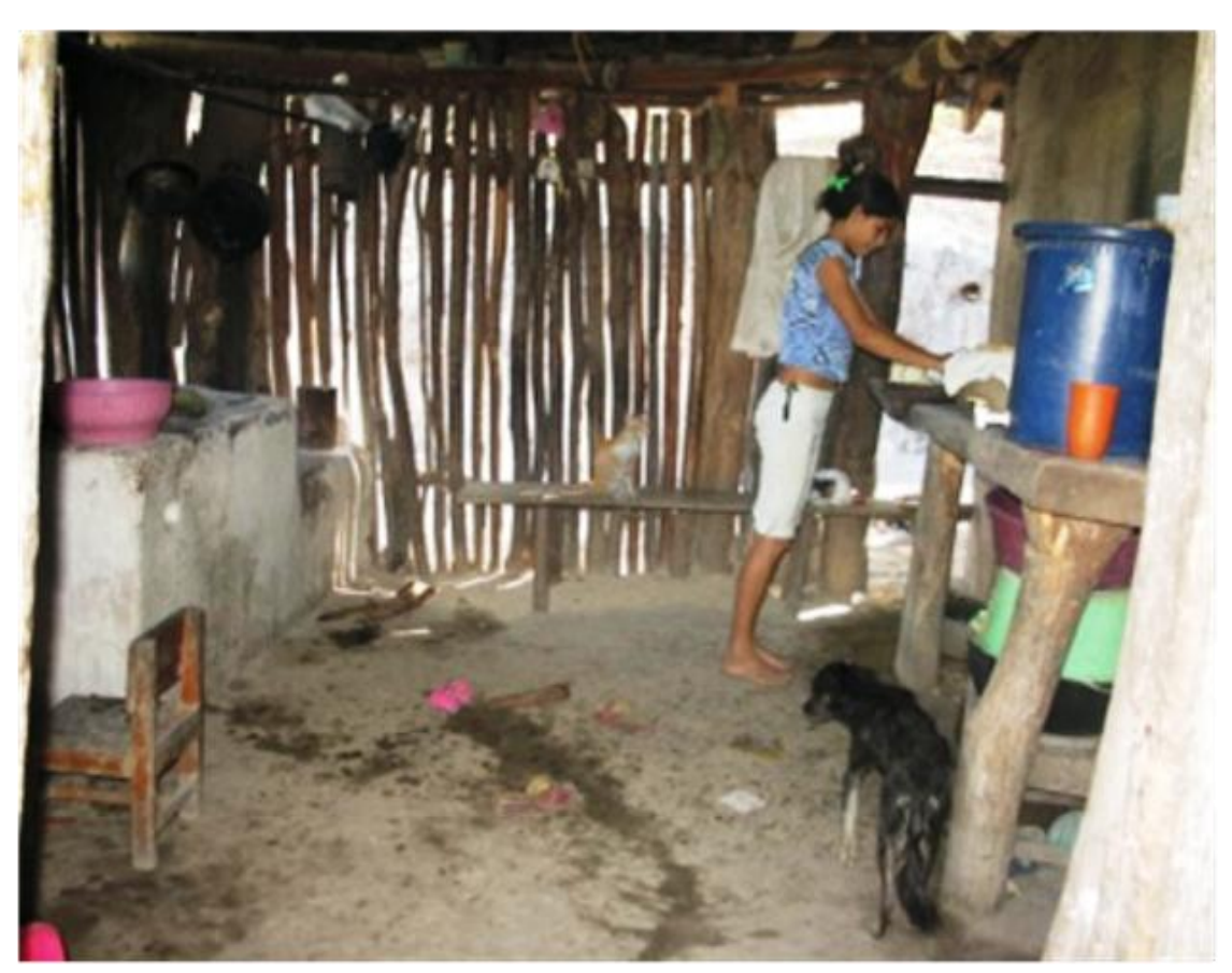
Figure 4. Typical household of low-income rural area in Nicaragua.

This analysis shows the importance of socioeconomic factors for the vulnerability to leptospirosis outbreaks. The unsatisfied basic need for quality of the household, as well as the UBN for access to sanitary services and the extreme poverty rates are the basic components of the vulnerability index. These findings are consistent with the verbal reports during field work in Nicaragua, in which local experts reported that outbreaks coincided with harvest periods and heavy rains, and that farmers from low-income areas have the habit of putting animals and crops inside the household to protect them from the rain. The months of June to October are the time period with the highest precipitation in the Pacific Coast of Nicaragua, with the peak in September. The number of leptospirosis cases significantly increases during this time, compared to the dry season in the beginning of the year it is about ten times higher [4]. In dwellings without adequate floors, e.g., permeable instead of concrete floors, animal urine in a muddy floor with rain turns into a wet environment, which increases the risk of leptospirosis transmission (Figure 4). Similarly, crops stored improperly inside dwellings built with vulnerable materials can attract infected wild rodents and also increase the risk of transmission. In a previous study conducted in Nicaragua, a significant association between leptospirosis rates and percentage of rural population was found, which supports this finding [4].