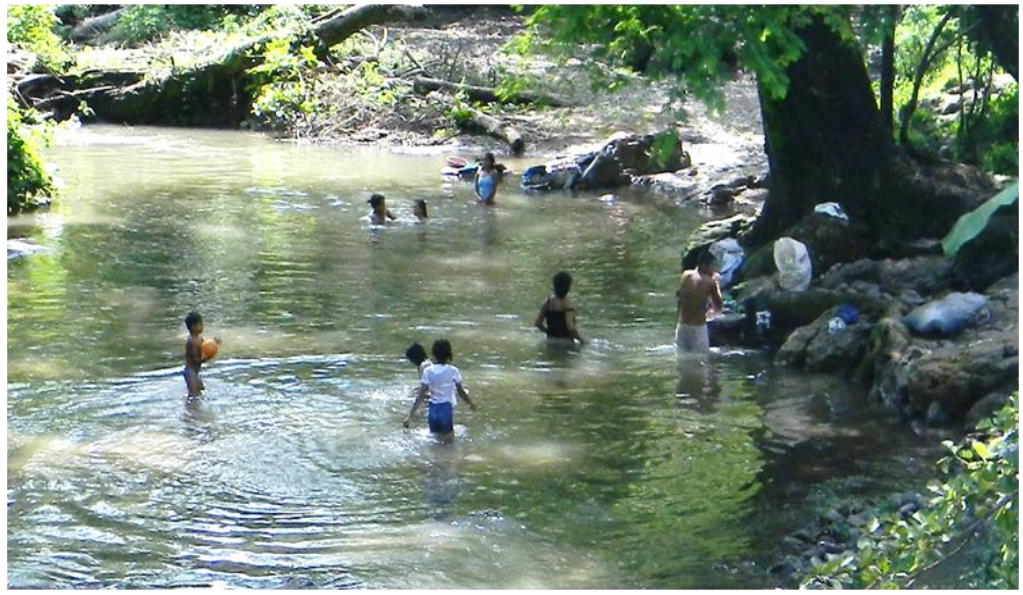
Note: Photo: Gilberto Moreno.

Figure 5. The use of rivers or creeks for different purposes in low-income rural areas in Nicaragua.