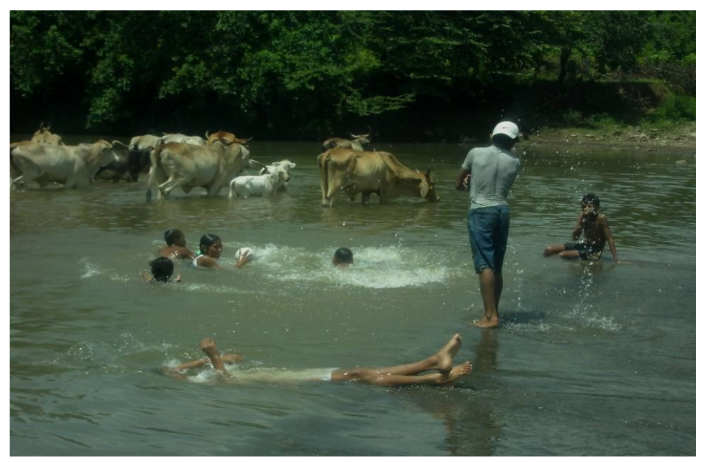
Figure 6. Humans and animals using the river in rural areas in Nicaragua.