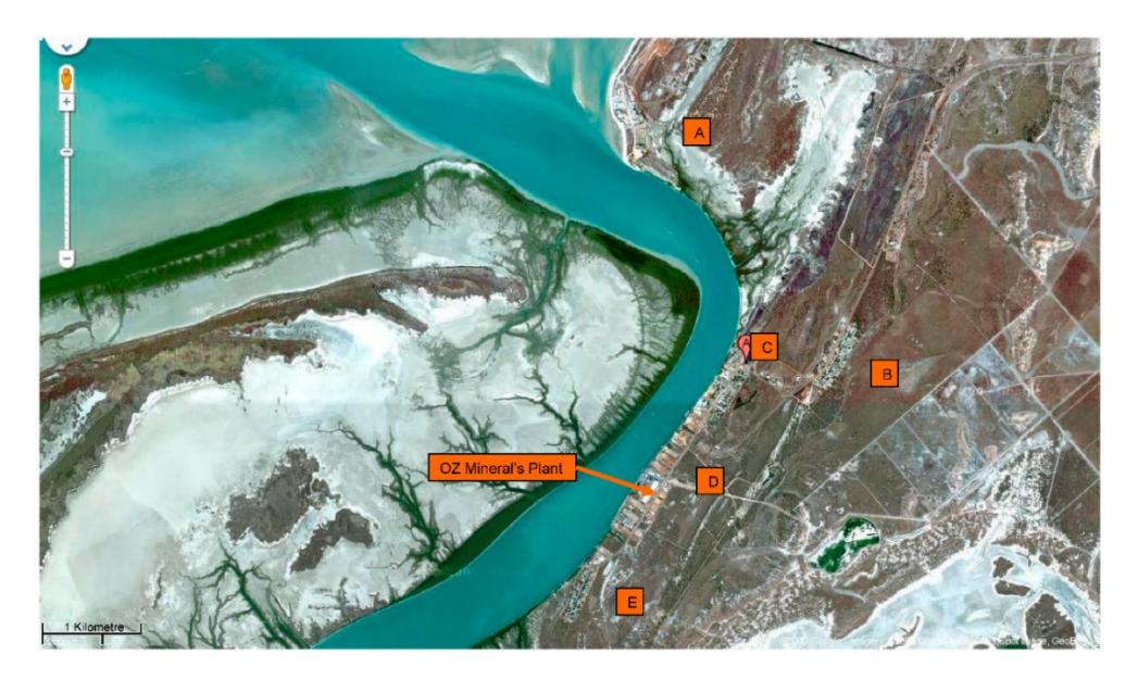
Figure 2. Map of Karumba Area showing OZ Mineral's Mineral Processing and Export Facility and the localities of Karumba Point ( A ); Henry Street Area ( B ); Town Centre ( C ); Yappar Street Area ( D ) and Highbanks ( E ).

figures are given in Supplementary Materials Table S1. Particulate Pb surface loadings were considered an indicator of risks to tank water quality. It was understood that resultant Pb concentrations in the collection tanks would be influenced by other factors such as tank material, the volume of rainfall that collected in the tank and hence degree of dilution, presence of and effectiveness of any first flush diversion device fitted to the tank inlet, and the degree to which particulate matter, settled or dissolved, in the tank. As mentioned above, the key aim of the investigation was to ascertain whether the ore processing facility was a material contributor to the elevated Pb concentrations previously measured in the tanks, which was a concern to the local community.