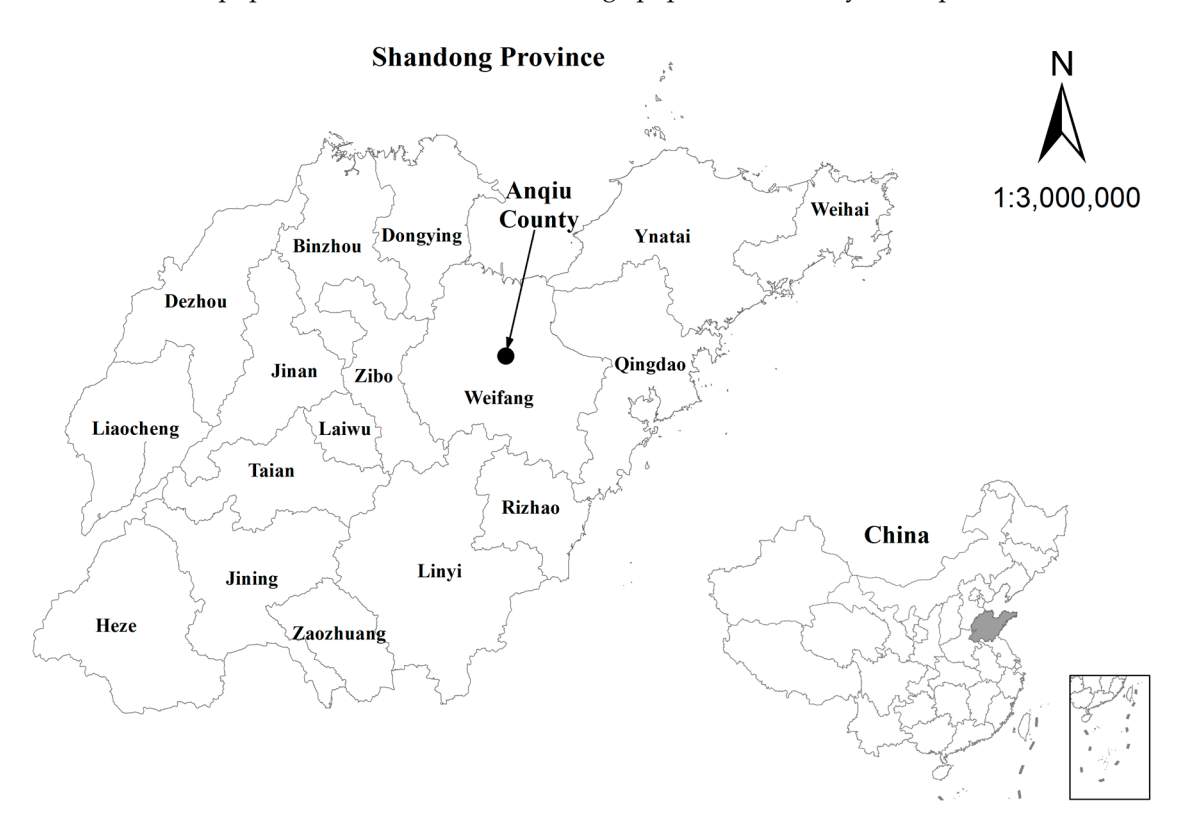
Figure 1. Location of the study area in China.

This study was conducted in Anqiu County, Shandong Province, China (Figure 1), located between 36^{\circ}05' and 36^{\circ}38' north latitude and 118^{\circ}44' to 119^{\circ}27' east longitude. It has a total land area of 1760 km<sup>2</sup> and a population of 950,000. The average population density is 539 per km<sup>2</sup>.