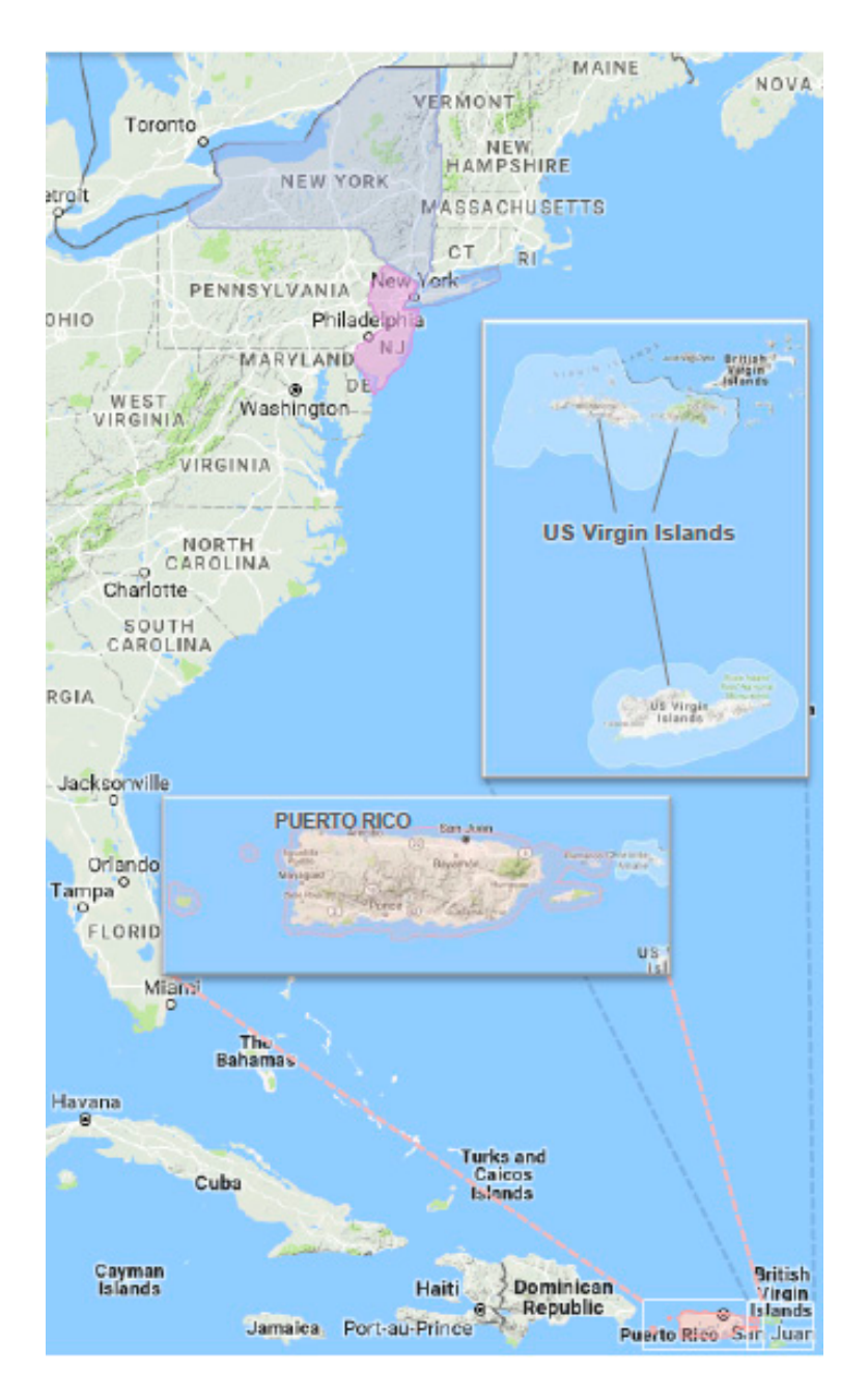
Figure 1. Map of US Federal Region 2: New Jersey (NJ), New York, Puerto Rico, and US Virgin Islands (image created from Google Maps).