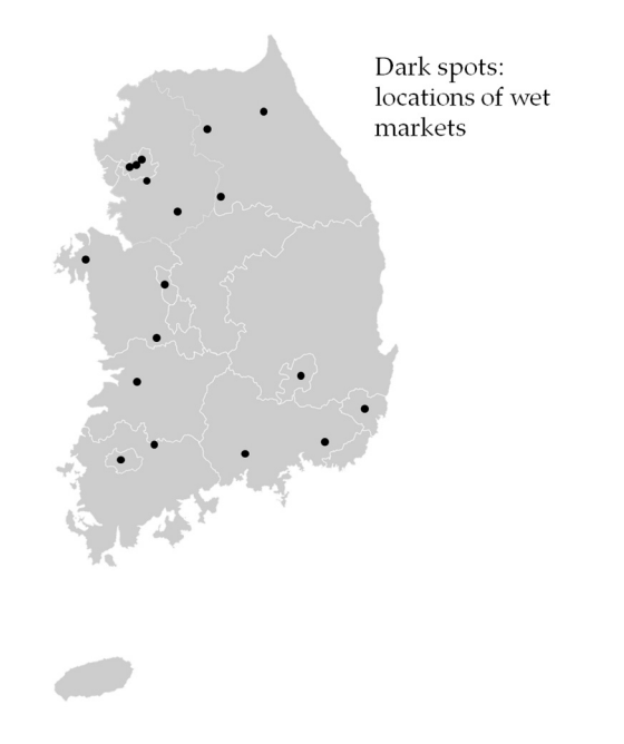
Figure 1. The locations of wet markets for poultry samples collected in Korea.

Chicken (n = 152) and duck (n = 154) carcasses were purchased from 18 wet markets throughout Korea during the summer (June–August, in 2014) and winter seasons (December in 2014 to February in 2015) (Figure 1). Three to ten samples for both chicken and duck carcasses were collected per market and per visit, and each market was visited twice for summer and winter. The samples were placed in a cooler on ice and transported to a laboratory. They were analyzed within 24 h.