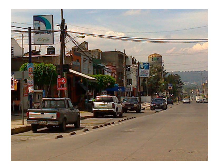
Figure 3. This image was not included in the survey. It shows how drivers park on a cycle track built in the city of Morelia around 2013.

The participants did not prefer invadable cycle tracks due to the possibility that car drivers could drive into or park on these cycle tracks. Individuals in other countries might respect a modest line on invadable cycle tracks, whereas, in Mexico, solid and high barriers are necessary to deter drivers. The participants indicated that separations needed to be large, visible, and not destructible. Even though these cycle tracks were invadable, security improved with the cycle track. For economic development, participants thought having ground floor retail was an economic trigger.