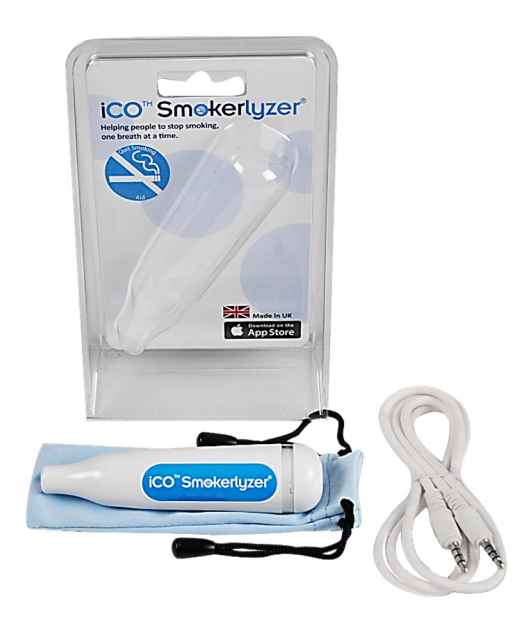
Figure 1. iCO<sup>TM</sup> Smokerlyzer<sup>®</sup> developed by Bedfont<sup>®</sup> Scientific Ltd., which was used as a prompt in the study to elicit views and preferences regarding a personal CO monitor and its potential use. The device uses a cable to connect to a smartphone through the phone's audio jack.

Although a number of studies have been conducted to elicit smokers' views and preferences for digital cessation programs, including smartphone apps [41–44], limited research exists on CSSs. Little is known about the views of potential users on personal CO monitors, associated apps, and their use, all of which could impact on satisfaction, uptake of and engagement with CSSs, and eventually also on effectiveness [41,45]. This study aimed to address these gaps. The study is nested within a project that follows guidelines on the development of digital interventions [7], the Medical Research Council's Guidance on the development and evaluation of complex interventions [46] and the Person-Based Approach to intervention development [8,47]. These approaches advocate the process to be iterative and cyclical, involving needs assessment with initial design concepts and research methods consulted among smaller samples of potential end-users, and iteratively adopted before being used in larger or more definitive studies.