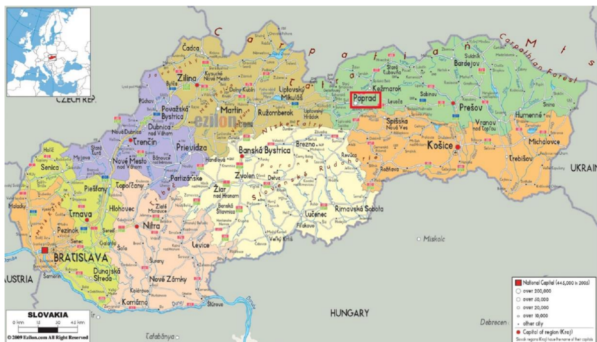
Figure 1. Slovakia, showing the city of Poprad (red rectangle)

In line with Radicova [54], we described the three groups as dwellers in integrated or separated communities, or segregated settlements. Regarding ethnicity, we worked with the Rumungre Roma living in the east of Slovakia [55]. We used random sampling with no defined criteria. In our field research conducted in 2012–2013, we interviewed more than 50 people, conducted two focus groups, made more than 1700 min of recordings, and took more than 250 photographs. At the beginning of the research, local intermediaries introduced us to the families who provided us with a place to stay. The interviews on nutrition patterns were conducted in family settings. Then, we visited randomly chosen houses and huts. Some people even sought us out and wanted to share their everyday reality. The semi-structured observations and interviews took place in the natural environment of the dwellers in the three types of settlements. The data were collected in three localities of the Poprad district: a segregated settlement, a separated concentration, and the town itself, where the Roma live integrated among the majority of the population (Figures 1 and 2).