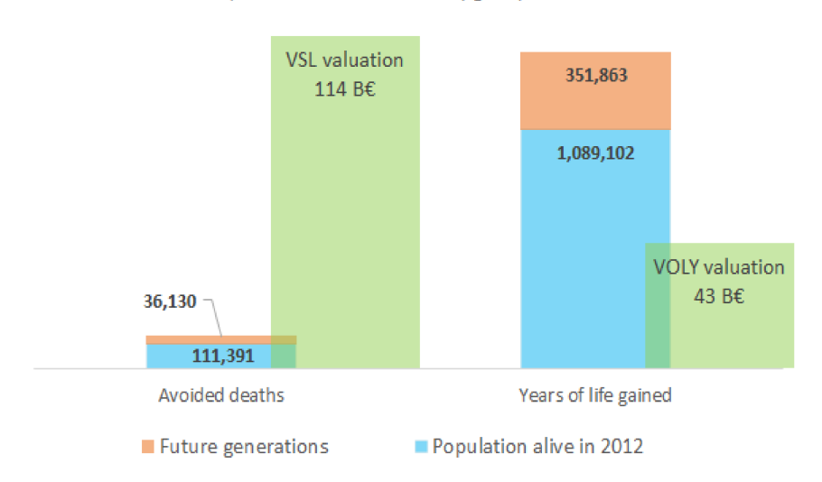
Figure 3. Scenario 2: Cumulative mortality benefit of PM_{2.5} emission reductions for the city of Skopje aggregated over a follow up period of 105 years.