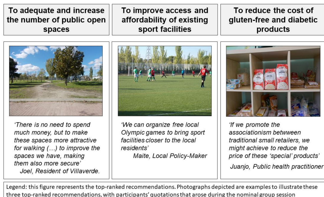
Figure 3. Top-ranked policy recommendations for obesity prevention.

residents, policy-makers, researchers and public health professionals shared their votes, the agreements and their different point of views of the ranking.