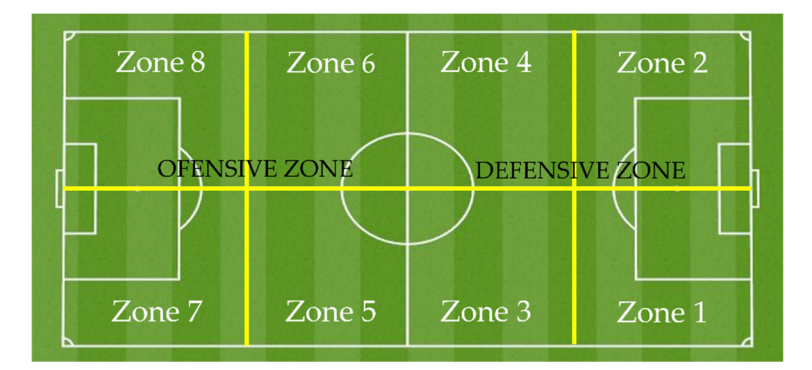
Figure 1. Field areas.

The categorisation of the type of injury followed the UEFA model [22]. To designate the part of the body where the injury occurred, a classification endorsed by other authors was used [23–25]. Four demarcations were used for the analysis [14,19,25,26] and divided the match into 15 min intervals [5,9].