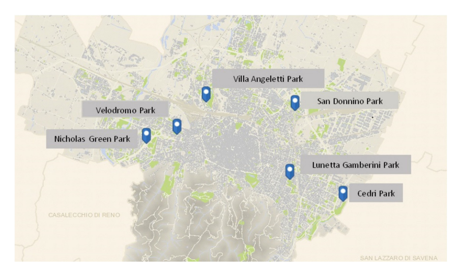
Figure A1. Map of Bologna, with highlighted the six parks considered.

The six parks are in different neighborhoods of Bologna and have different characteristics, listed below.