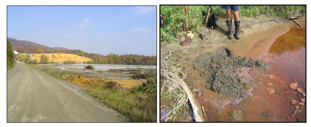
(a) Former Eustis mine (b) Bank (left) of Massawippi River

Figure 2. (a) View from the landfill of the former Eustis mine. The site serves as a pulp and paper waste disposal and storage site. (b) High concentrations of residual iron and other tailings on a riverbank of Massawippi River near Eustis mine, Southern Québec.