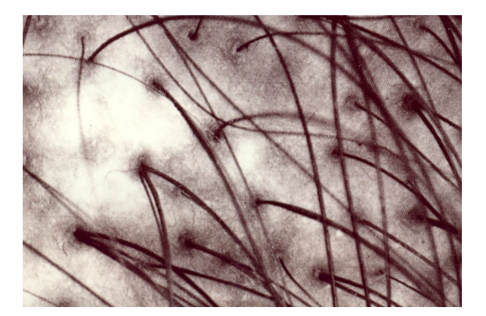
Figure 3. A man's occipital area. A larger fuzzy amelanotic area.